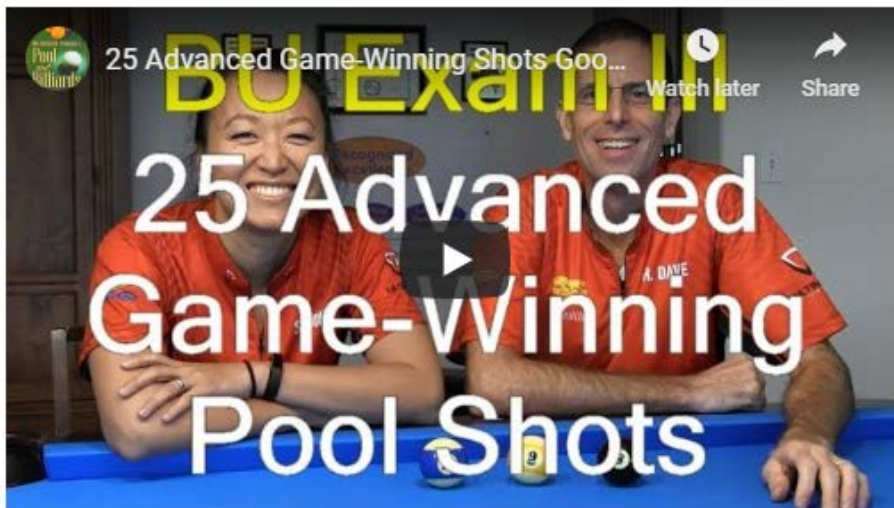
Image 4 Videos on website

Here are demonstrations of all of the Exam III shots: