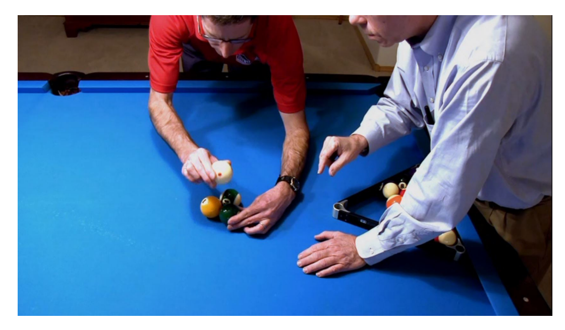
Diagram 2 Tapping balls into place

Now, while holding the balls firmly in place, lightly tap down on each. Then firm up the ball placements by tapping down with more force, one row at a time, as shown in Diagram 2 . It can help to gradually increase the force of the tapping as you continually ensure each ball is touching and slightly pushing against its neighbors. Do this for a full 15-ball rack so the training can be used for all games. If any ball fails to touch all of its neighbors, you might need to tap it down firmly again, being careful to make sure it is pushing against its neighbors while tapping. When done properly, all of the other balls in the rack should move slightly during the tapping.