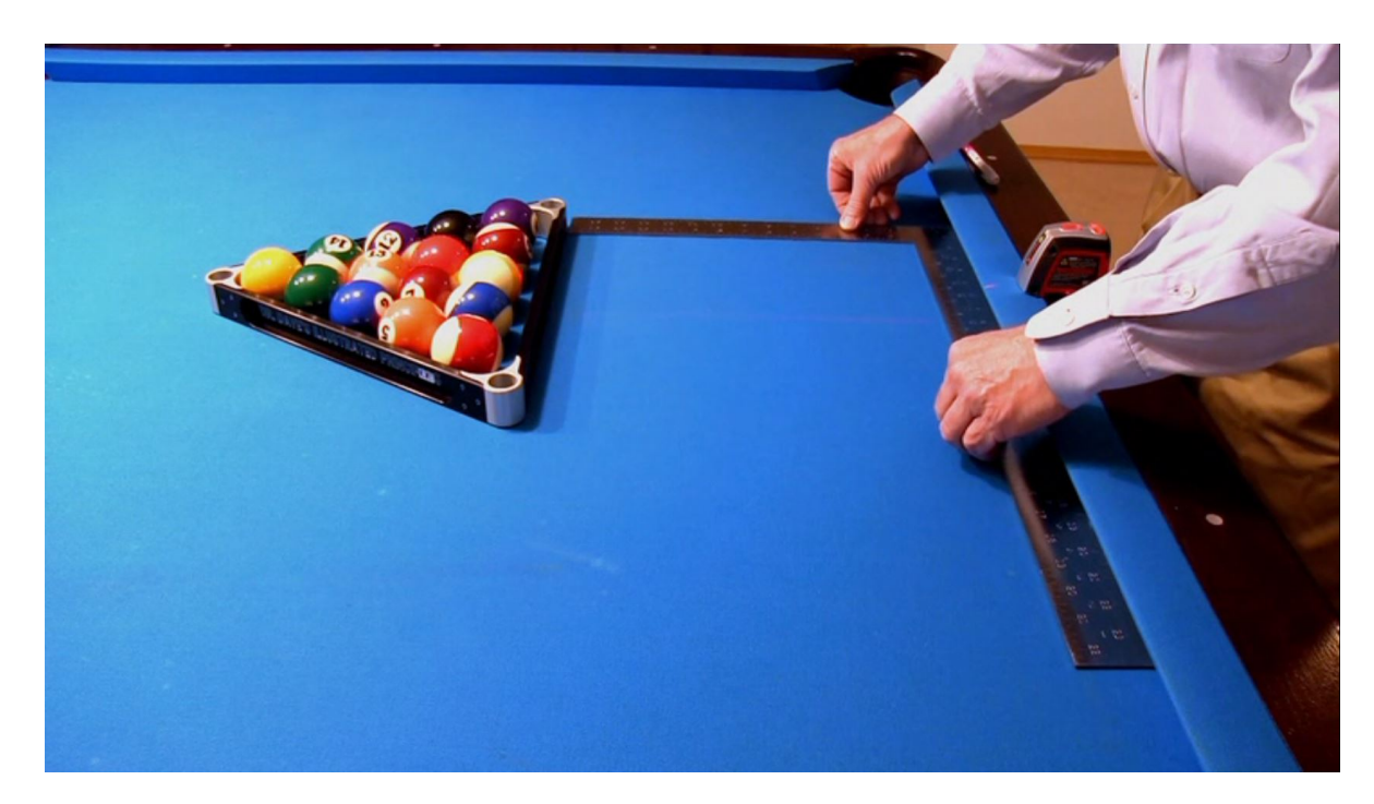
Diagram 1 Aligning the rack