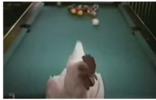
Image 2 Bud Light pool-playing chicken