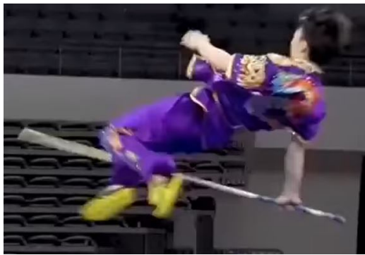
Image 7 Mushu cue acrobat