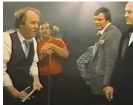
Image 4 Miller Light Mizerak less filling

Another funny ad is the "history of pool" by Guinness, showing in a hilarious way how and why the cue, rails, and pockets were invented (see Image 5 ). Hitting the CB with your finger made it sore after a while, and it got old chasing down and picking up balls from the floor. This and all the other beer-ad videos are worth a watch if you haven't seen them yet.