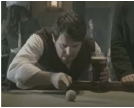
Image 5 Guinness history of pool

Now let's look at some TV shows and movies that have included interesting pool moments. In the greatest pool movie of all time "The Color of Money," Tom Cruise was being a fool twirling the cue around like a ninja "Last Samurai" warrior (see Image 6 ). A Wushu Asian martial arts gymnast using a cue as a prop goes well beyond this (see Image 7 ). Tom Cruise's pool game wasn't great in the movie since most of the shots he actually played were easy setup shots, but "his hair was perfect" as he mouthed lyrics from the song "Werewolves of London" playing in the background (see Image 8 ).