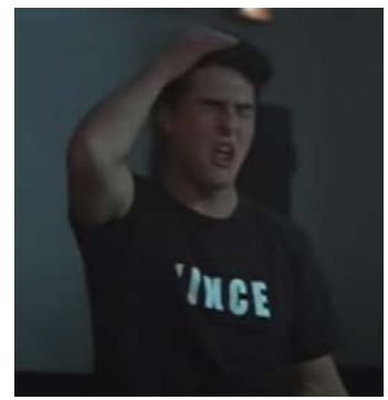
Image 8 Tom Cruise hair

Comedian Bill Murray became a skilled pool hustler with all the time he had in one of my favorite movies of all time: "Ground Hog Day" (see Image 9 ). And in a 1961 episode of "The Twilight Zone," pool shark Jesse Cardiff (Jack Klugman) faces off against the devil spirit of "Fats" Brown (Jonathan Winters) for the challenge of his life ... literally (see Image 10 ).