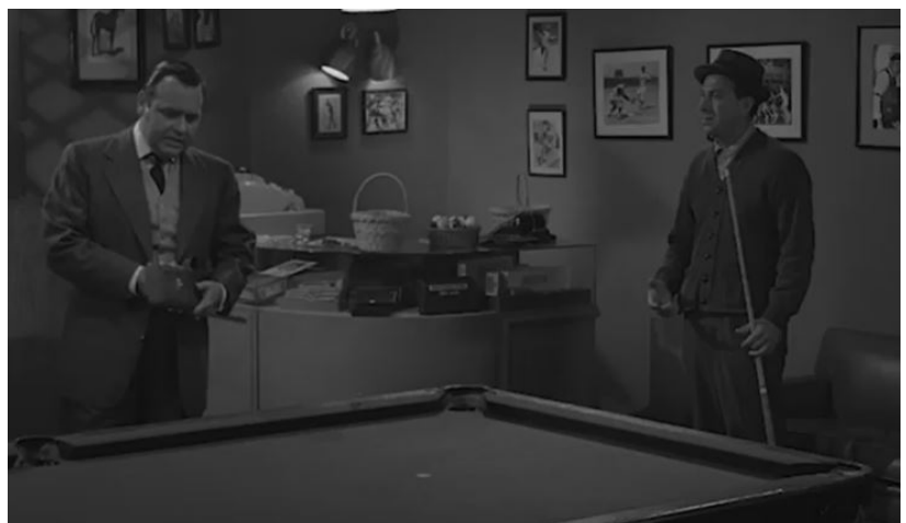
Image 10 Twilight Zone game of your life