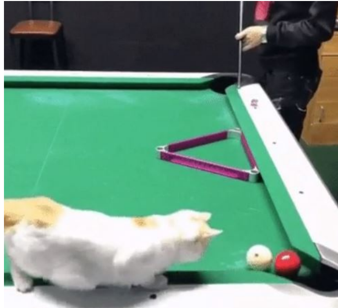
Image 17 Cat cameo appearance

Those sneaky cats can even make cameo appearances in pool videos. Check out the massé shot video with a cat assist (see Image 17 ). Even pool videos are more adorable with cats.