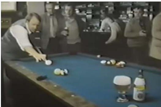
Image 3 Miller Light Mizerak trick shots

If you prefer Miller Light over Bud Light, you can watch Steve Mizerak shoot a fun sequence of three trick shots in a single take (see Image 3 ) or watch him try to convince a bunch of celebrities of the time, including famous comedian Rodney Dangerfield, that Miller being "Less Filling" is more important than it "Tasting Great" (see Image 4 ). I always thought that was an odd advertising ploy, trying to convince potential customers that the beer's taste isn't as important as it having fewer calories.