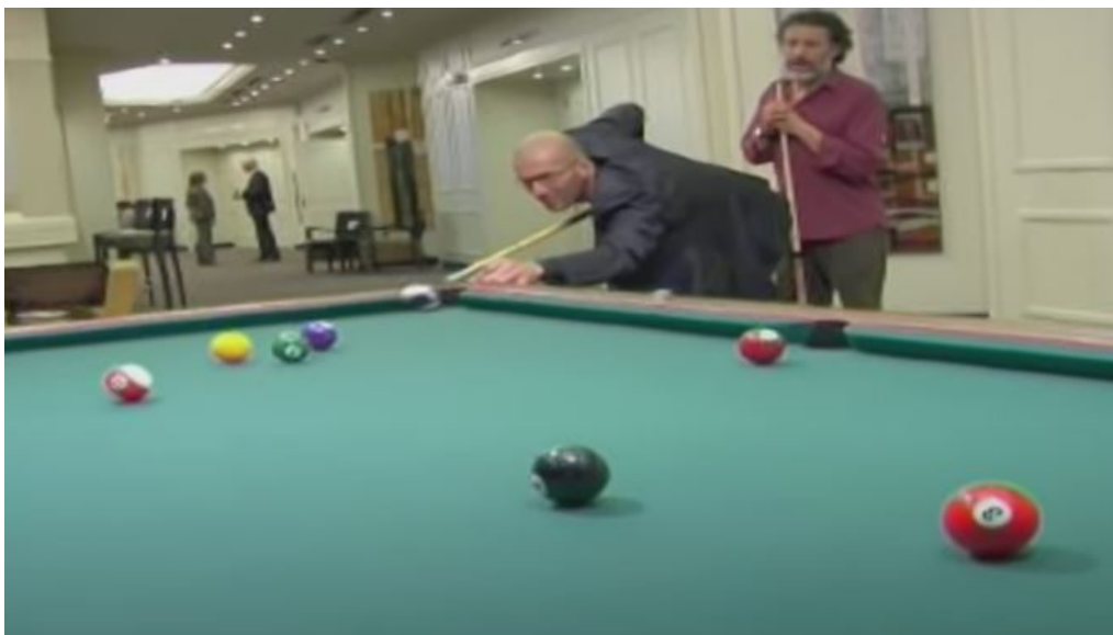
Image 11 French eyeglasses ad

Sometimes ad agencies use fancy video editing and computer graphics to create pool shots not possible. In an ad for GrandOptical Eyeglasses, famous French soccer player Zinedine Zidane pockets 8 balls in one shot, all in the same pocket, obviously due to the effectiveness of the eyeglasses (see Image 11 ).