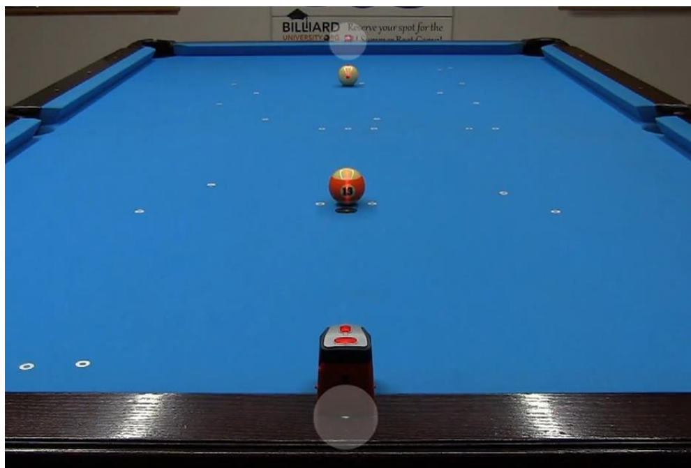
Image 2 Ball setup

If you don't have a laser level, don't despair. You can be just as accurate using your eyes, using two extra balls frozen to the head and foot cushions in the center of the table. As demonstrated in the video, just close one eye and get down low to look over the tops of the balls. If a ball is off the line, you will be able to clearly see it. Just nudge the ball positions until they all appear to be in a straight line.